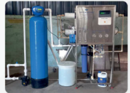
MARTIN COLLEGE - COIMBATORE