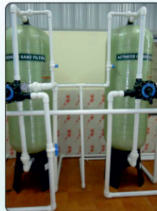
SAND & CARBON FILTRATION