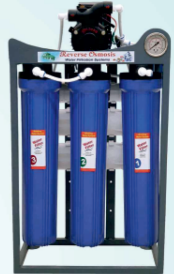
75 LPH OPEN MS SKID