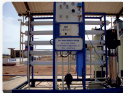
GUHAN TEXTILE - VEDASANDUR