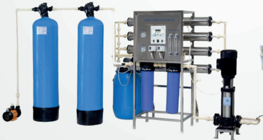
APS - 1000 LPH FULLY SS