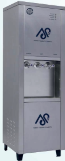
APS 80 - NORMAL APS 80 - N +H APS 80 - N +C APS 80 - N+H + C