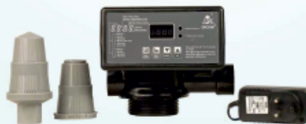
AUTOMATIC MPV VALVE