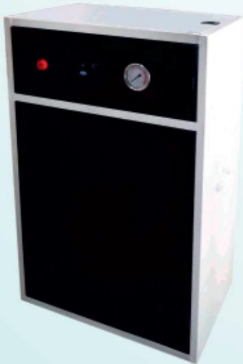
50 LPH CLOSED MS SKID