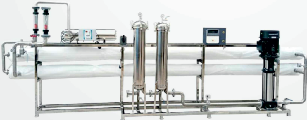
APS - 10,000 LPH REGULAR