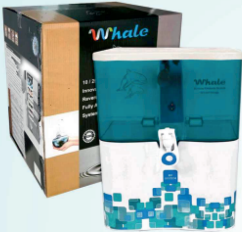
25 LPH WITH STORAGE