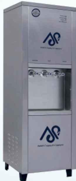
APS 100 - NORMAL APS 100 - N +H APS 100 - N +C APS 100 - N+H + C