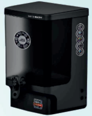
AQUA JADE - BLACK