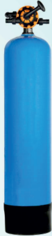
MULTI MEDIA FILTRATION