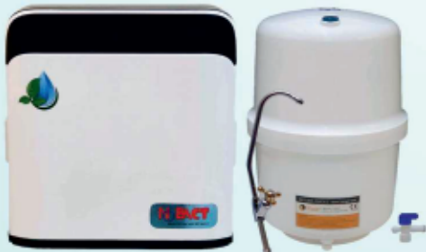
AQUA UNDER SKIN