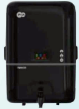
AQUA PURE - BLACK