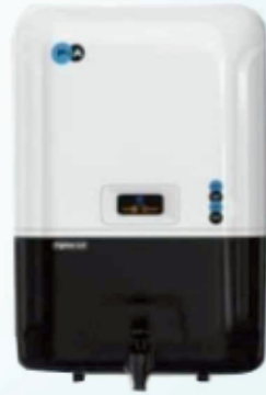
AQUA PURE - B/W