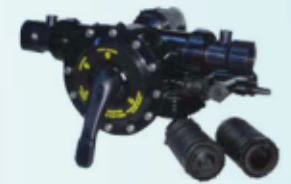
40NB - MPV SMS VALVE