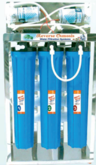
50 LPH OPEN SS SKID