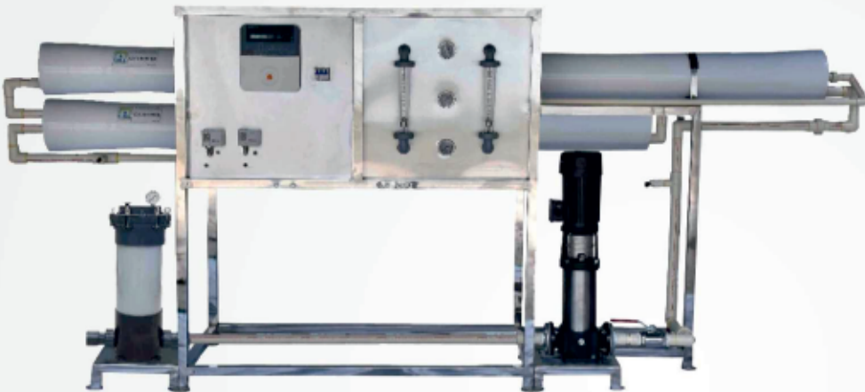
APS - 5000 LPH REGULAR