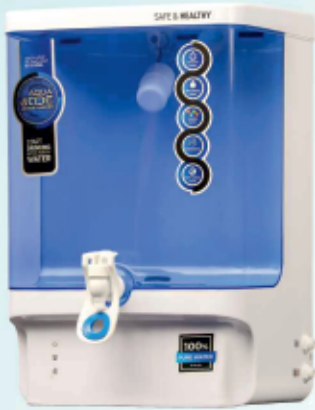
AQUA JADE - BLUE