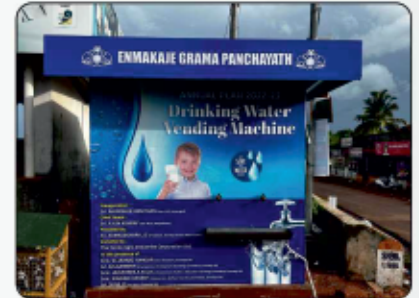
BUS STAND - KASARCODE