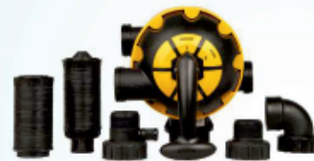
25NB - MPV TMF VALVE