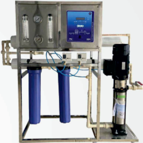
APS - 500 LPH REGULAR