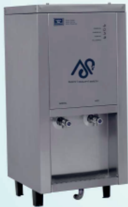
APS 50 - NORMAL APS 50 - N+H