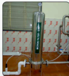
SS MICRON FILTER HOUSING