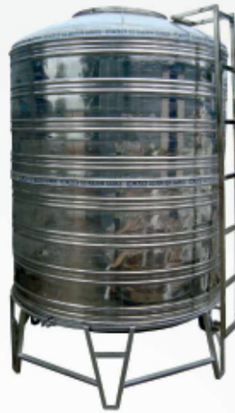
SS TANK (250 lit - 5000 lit)