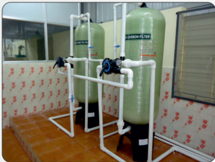
FRB SAND & CARBON FILTER