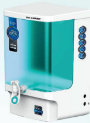
AQUA JADE - GREEN