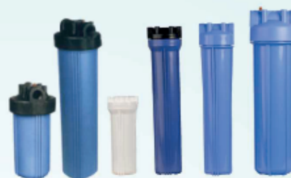
FRB MICRON FILTER HOUSING