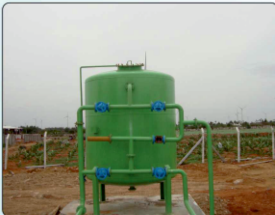
MS MULTI MEDIA FILTRATION