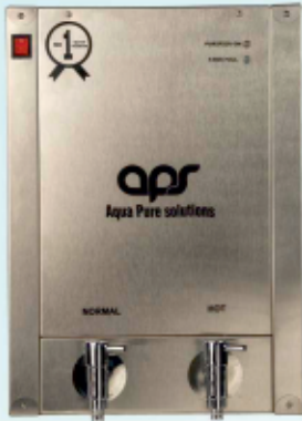
SS NORMAL +HOT