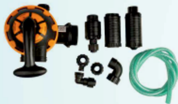
25NB - MPV TMS VALVE