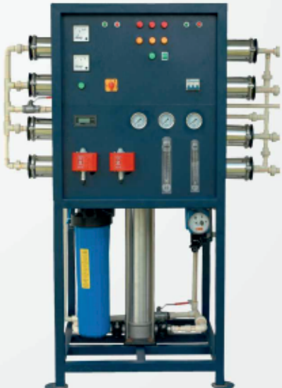
APS - 1000 LPH MS COMPACT