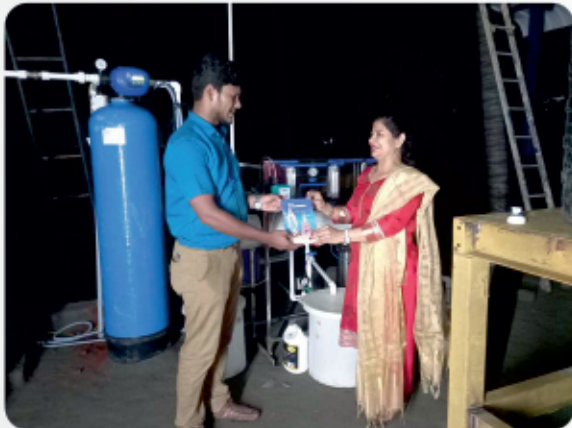
MARTIN GROUP OF COMPANY