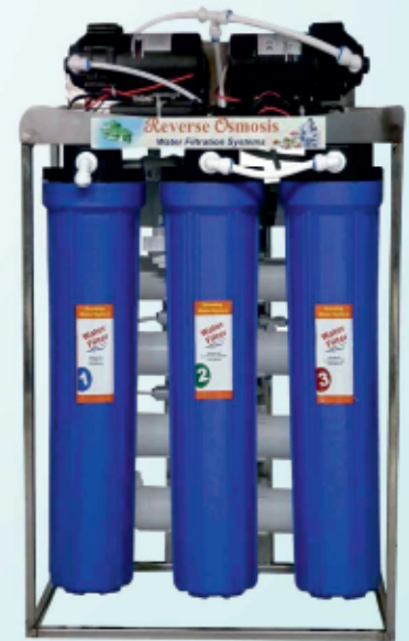
40 LPH OPEN SS SKID