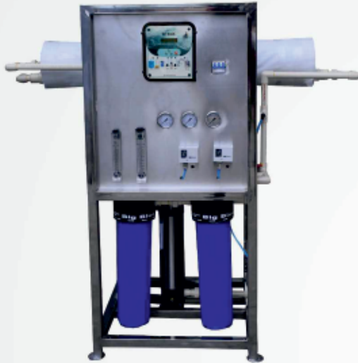
APS - 1000 LPH COMPACT