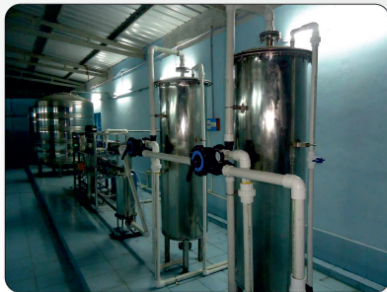
SS SAND & CARBON FILTER