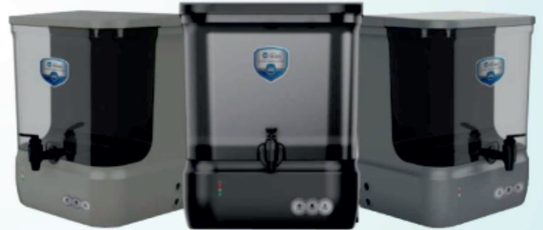
AQUA MARS - STONE BADGE / BLACK / GREY