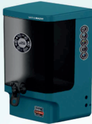
AQUA JADE - COMRADE BLUE