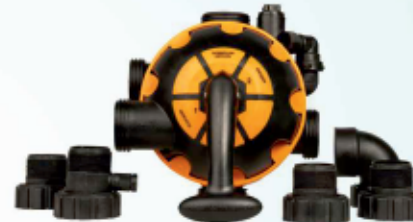
40NB - MPV SMF VALVE