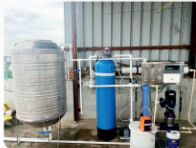
PANCHYAT OFFICE - NAMAKKAL