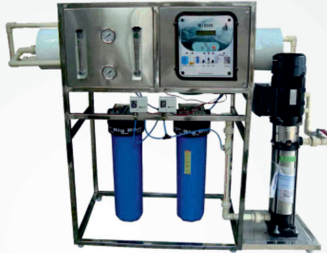
APS - 1000 LPH REGULAR