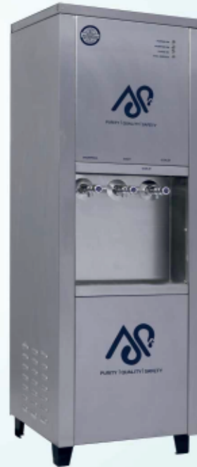
APS 125 - NORMAL APS 125 - N +H APS 125 - N +C APS 125 - N+H + C