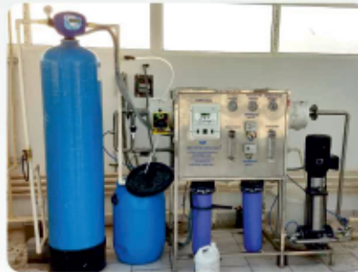
CPR HOUSE - TIRUPUR