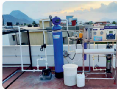
RESIDENCY - COIMBATORE