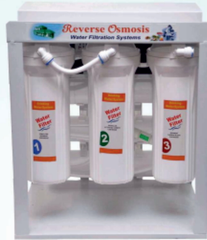
25 LPH OPEN SKID