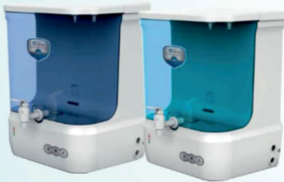
AQUA MARS - BLUE / GREEN