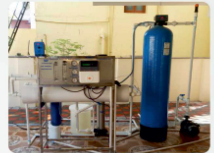
WINDSTONE RESIDENCY - COIMBATORE