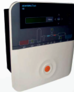
RO PANEL BOARD