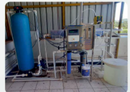
SPP SILKS - COIMBATORE