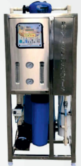
APS - 500 LPH COMPACT