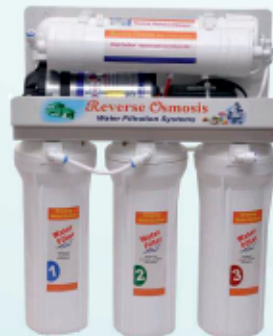
AQUA WALL MOUNT