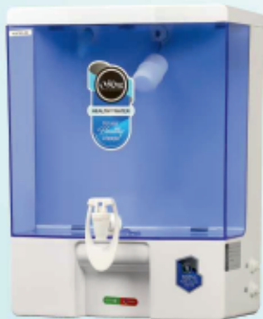
AQUA ALL PURE