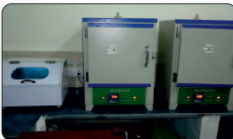
MICRO BIOLOGY LAB