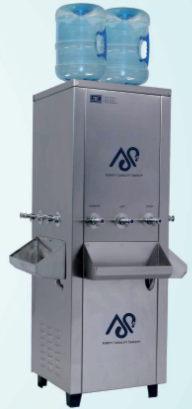
APS 250 - NORMAL APS 250 - N +H APS 250 - N +C APS 250 - N+H + C