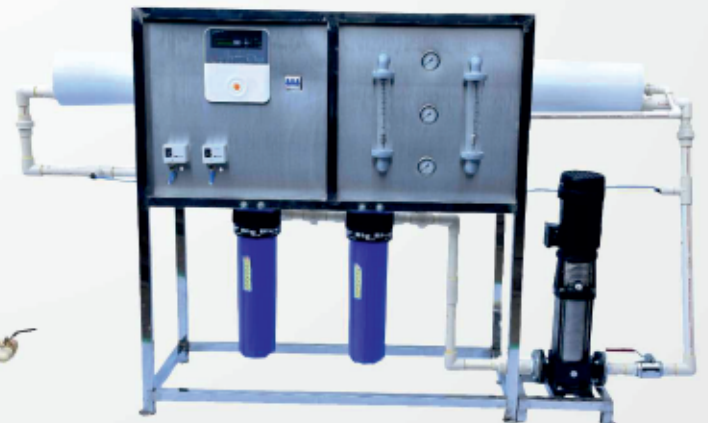
APS - 2000 LPH REGULAR